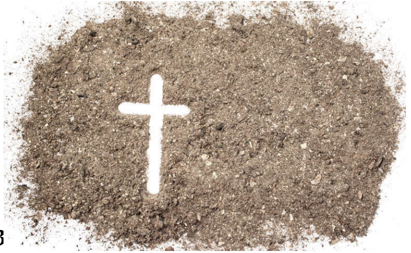
Lent Ashes