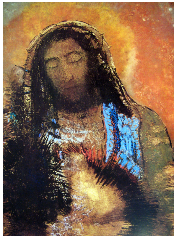
"The Sacred Heart of Jesus" (pastels on paper, 1910) by Odilon Redonn Musée d'Orsay

Hope does not disappoint, because the love of God has been poured out into our hearts through the holy